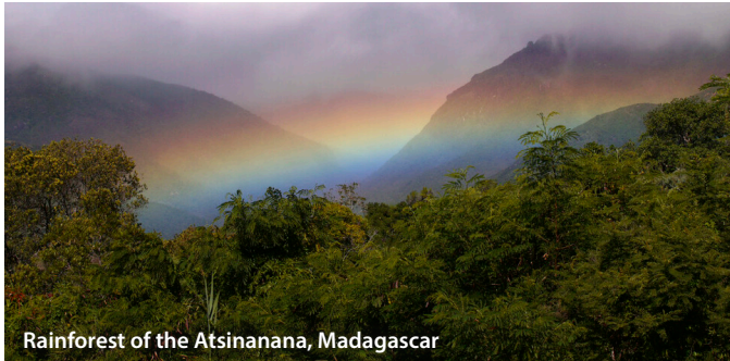
Rainforest of the Atsinanana, Madagascar