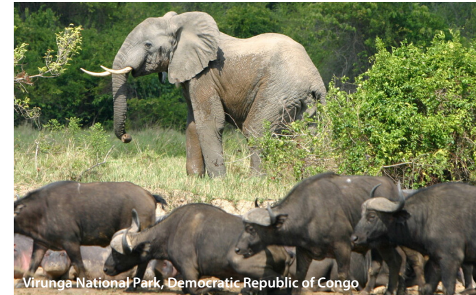
Virunga National Park, Democratic Republic of Congo