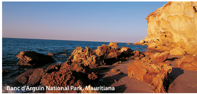
Banc d'Arguin National Park, Mauritania