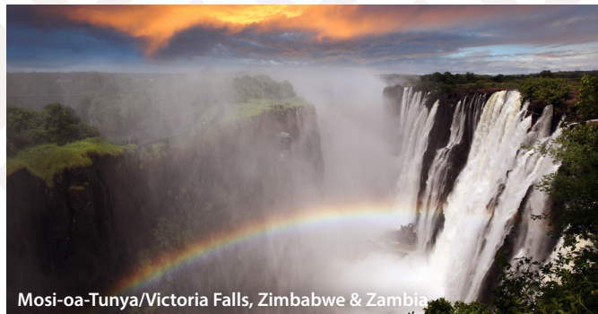
Mosi-oa-Tunya/Victoria Falls, Zimbabwe & Zambia