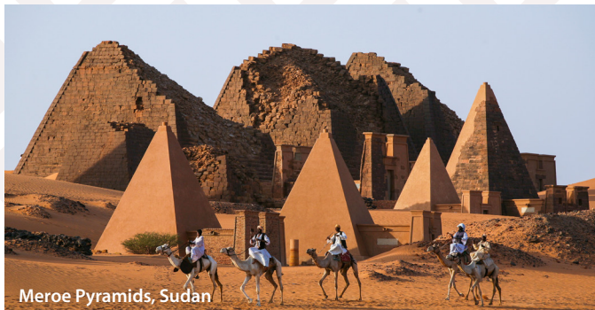
Meroe Pyramids, Sudan